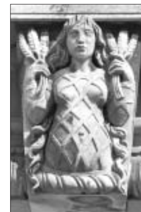
Maiden Keystone, Portland stone, 1960 by Charles Wheeler. City of London.