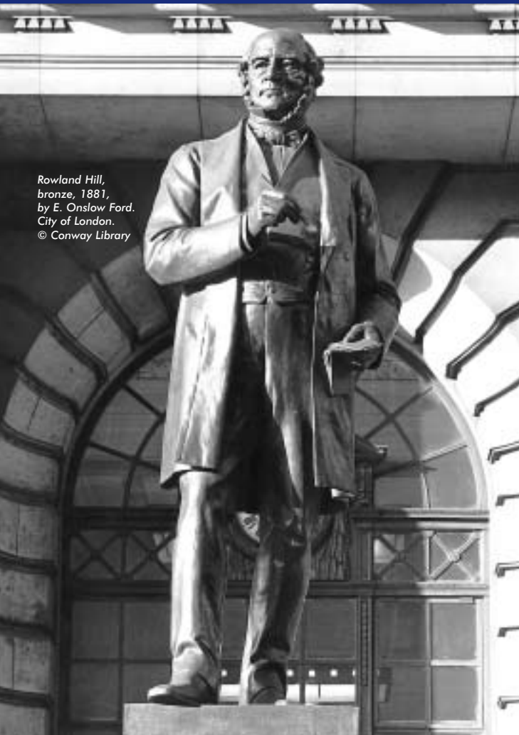
Rowland Hill, bronze, 1881, by E. Onslow Ford. City of London.

Liverpool City Council is using the database for its conservation programme; Save our Sculpture is recording sculptures at risk using the NRP database.