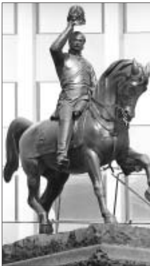
Albert, Prince Consort, bronze, 1873, by Charles Bacon. City of London.

The NRP was set up in 1997 with the aim of making an electronic survey of public monuments and sculpture in Britain ranging from Eleanor Crosses to the most contemporary works.