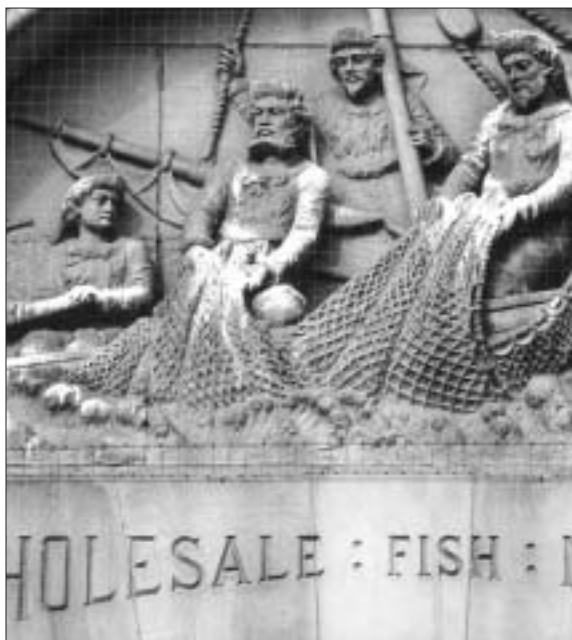
Fish Market, stone relief, 1873, Manchester.