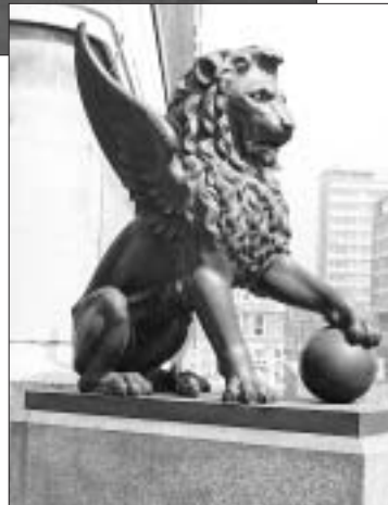
Winged Lion, bronze, 1870, by Farmer & Brindley. City of London.