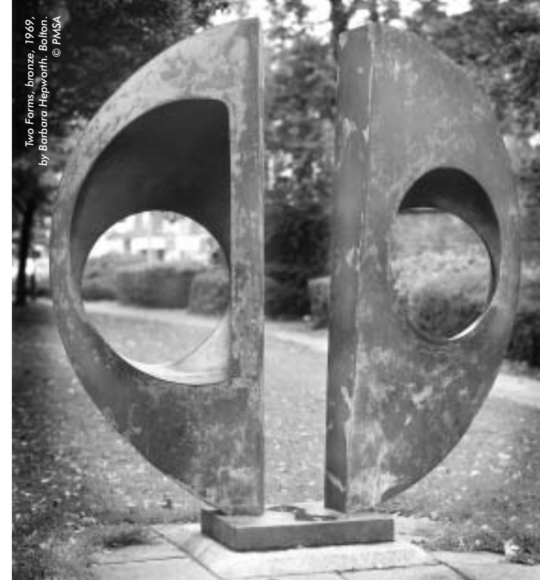
Two Forms, bronze, 1969, by Barbara Hepworth. Bolton.

For the promotion and preservation of public monuments and sculpture