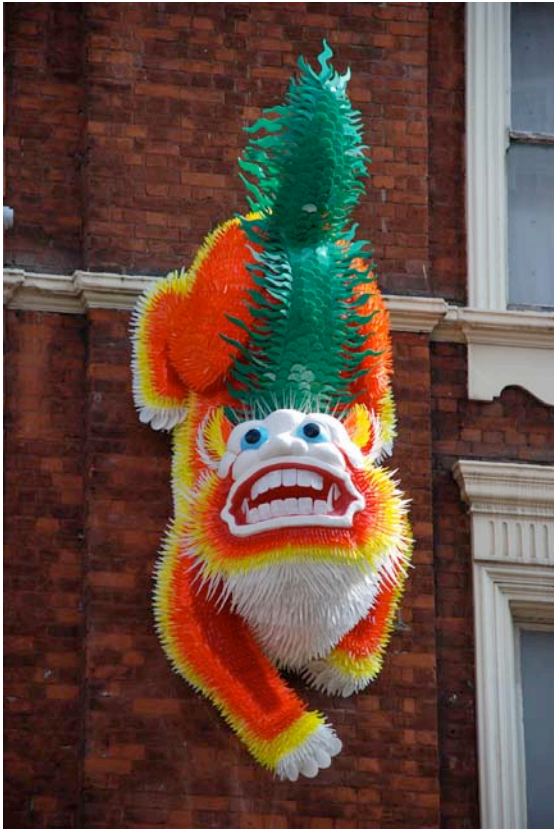
'The Lion', Chinatown.