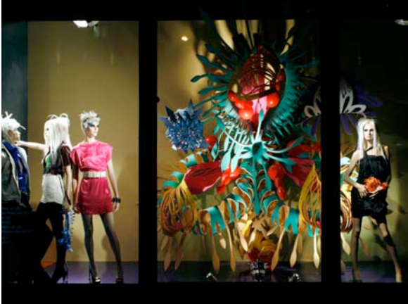
'Futuristic Flowers', Harvey Nichols