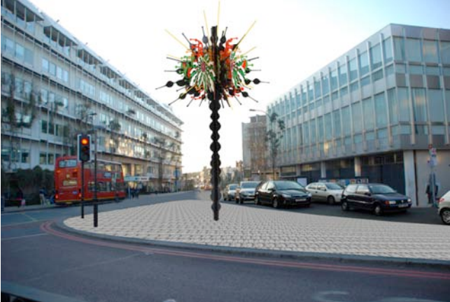
Visualisation of 'Origin of The Secret Two', Lewisham